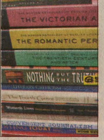
The new textbook provision will make it easier for students to find cheaper books.

nication between UCF students, professors, the on-campus bookstore and the offcampus competitors prevent this new policy from really doing its work.