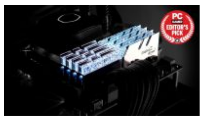
G.Skill Trident Z Royal DDR4-4000 gaming memory review ▶